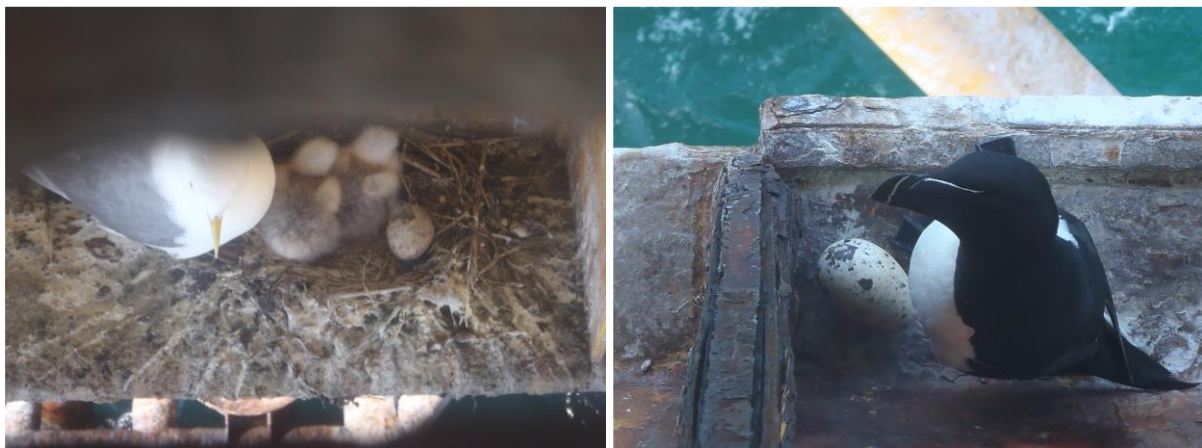
Figure 2 Photographs of breeding kittiwake (left) and breeding razorbill (right) on a platform within the Area of Highest Ecological Potential.